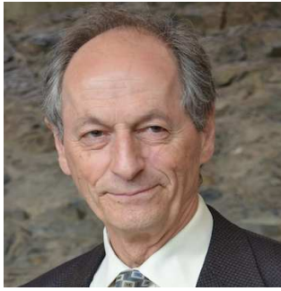
Sir Michael Marmot President, World Medical Association; Director, UCL Institute of Health Equity