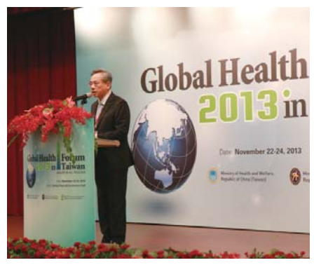
Minister of Health and Welfare, Wen-Ta Chiu (邱文 達) welcomes foreign and local health experts in an opening speech.

personalized treatment plans, pathology peerreview systems, core measurement indicators and evidence-based health care. The 5-year survival rate of patients of all cancer types improved from 47.5 percent during 2002 to 2006 to 51.1 percent during 2006 to 2010.