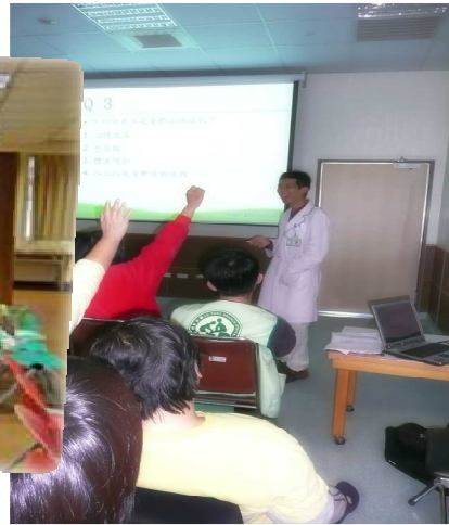
Education & training