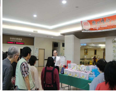
Community promotion activities