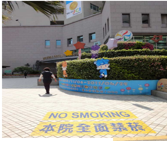
Maintaining smoke-free environments- indoors and outdoors